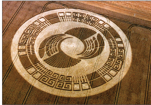
Mayan Calendar Crop Circle

On September 13, 2012, hundreds of us gathered from all over the Americas, Europe and New Zealand to learn from a host of Wisdom Keepers and Elders, and some of the world's great visionaries. Having been a speaker at both of SEED Graduate Institute's previous Healing Conferences, as well as a former member of the SEED Advisory Board, I was asked to be the M.D. of the Conference in case any of the participants, particularly the Elders, required medical attention. It was a great honor and privilege which